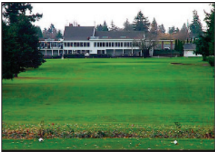
Colwood National Golf Course

If you do not have a team, one will be arranged for you. Tee times will be e-mailed, faxed or mailed to you no later than May 20th. Driving directions will be sent with your tee times. Prizes will be awarded at the Hall of Fame Banquet June 2 nd .